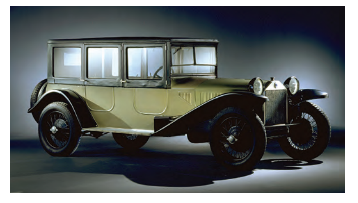
Right: The saloon version of the Lancia Lambda had a longer wheel base; the roof was detachable.

with the strength of the ship's hull as it cut through the waves. Whatever the reason behind it, Lancia applied for and received a patent for unitary construction and the first Lambda, a four-seat tourer, was ready for testing in 1921.