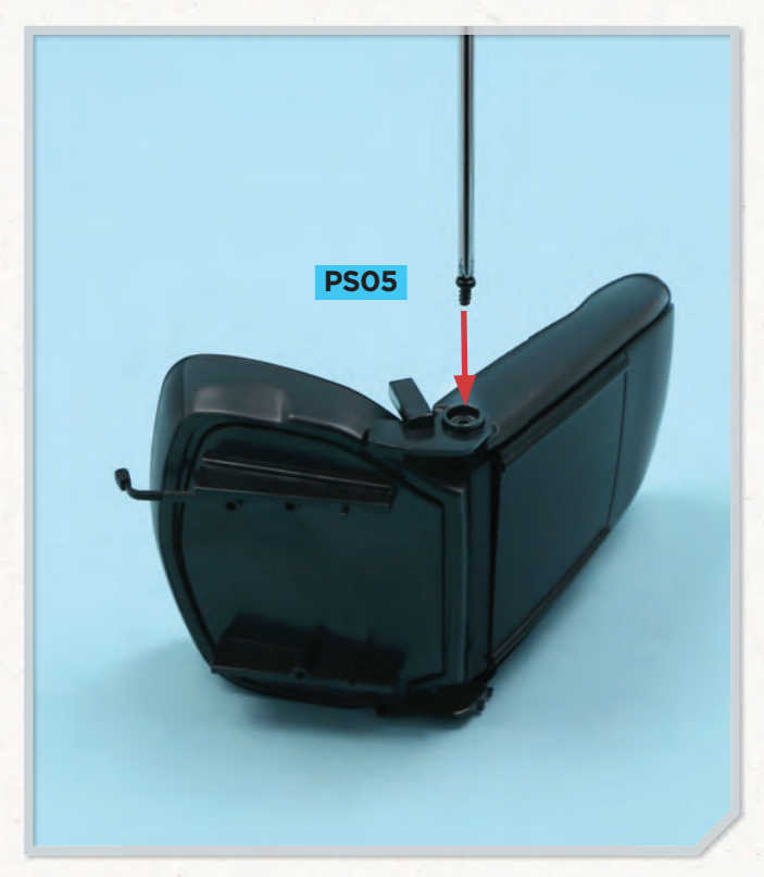
STEP 5 Fix in place with a PSO5 screw.

Check that the screw hole in the flange on the seat base frame 13A is aligned with the screw hole in the tab at the base of the seat back frame 14B .