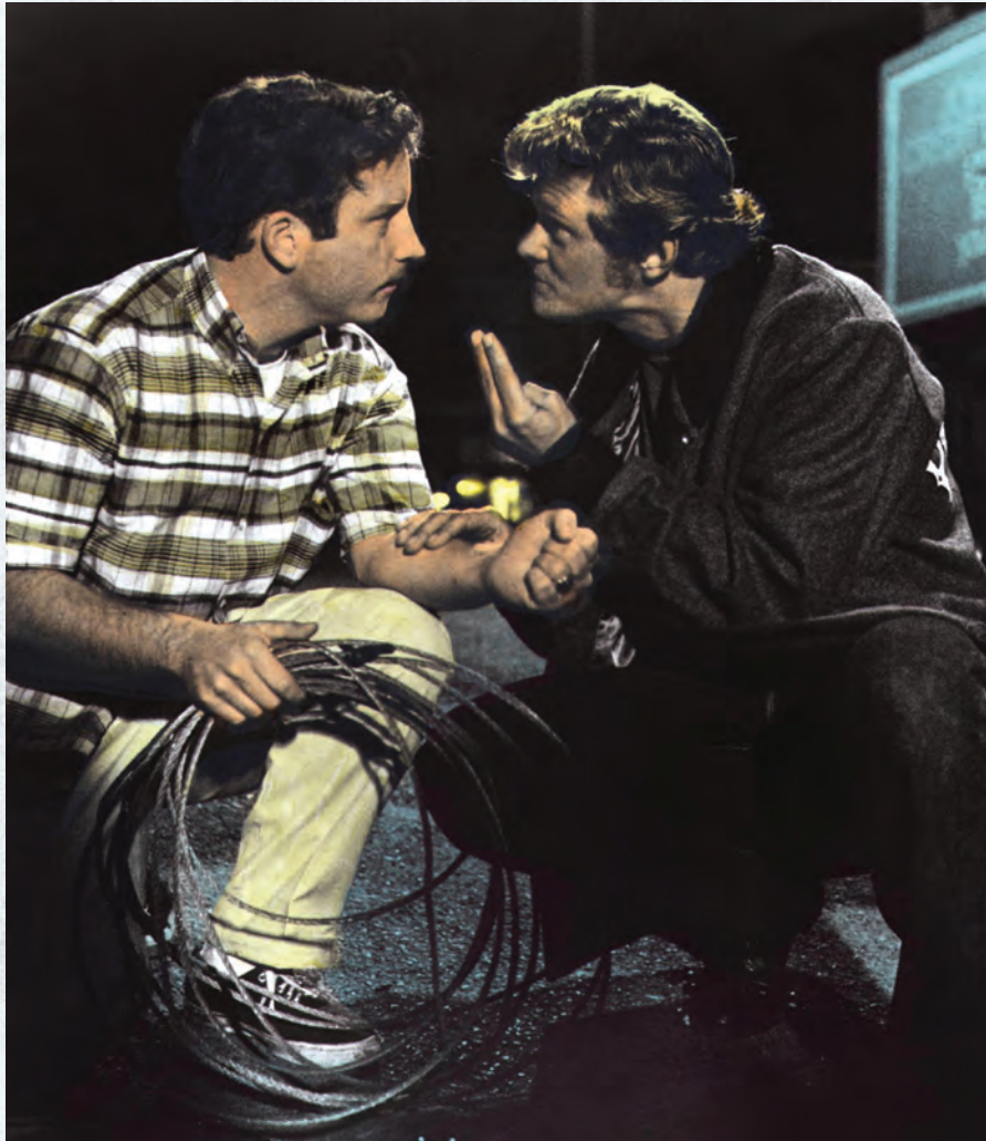
Joe (Bo Hopkins, right) gives Curt (Richard Dreyfuss) advice on how to deal with the Pharoahs.

studio employees. The Deuce still exists in screen-used condition.