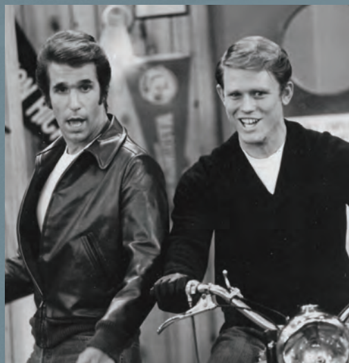
Richie (Ron Howard) takes a turn on the bike that belongs to Fonzie (Henry Winkler).

After playing the clean-cut kid in American Graffiti , Ron Howard moved to the TV screens in the sitcom Happy Days . However, the pilot for the series, starring Howard as Richie Cunningham and Henry Winkler as his friend Fonzie, had actually aired in 1972, and after George Lucas saw the pilot with Howard in action he cast him in American Graffiti . Both the film and the sitcom focus on the thrills and spills of life for young people in the early 1960s.