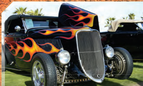
Lights and Paint