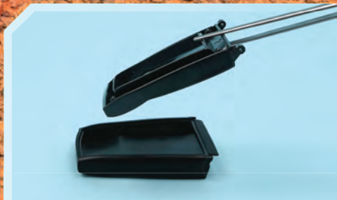
Right Seat Base